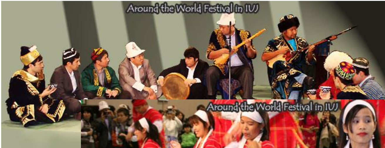
Around the World Festival in IVJ